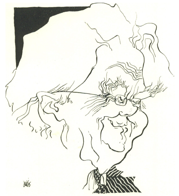
Globe and Mail, 1 December 1990