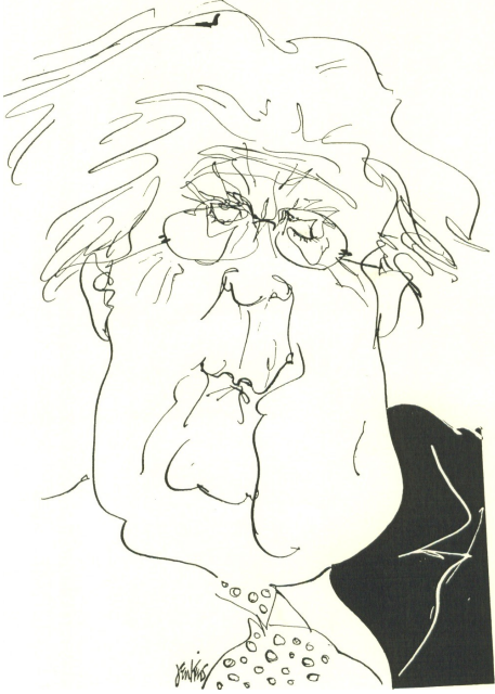
Globe and Mail, 14 June 1990