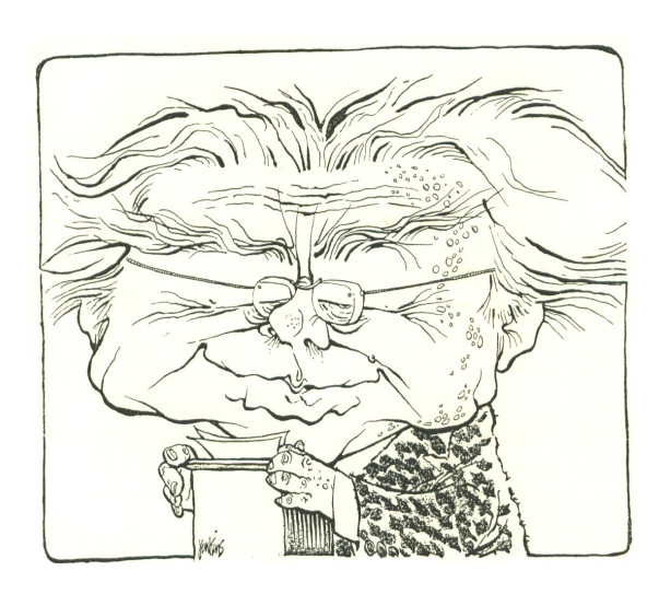
Globe and Mail 4 October 1986